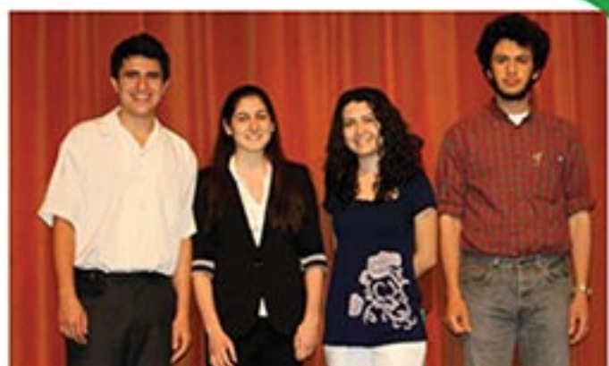
LAUSD award recipients