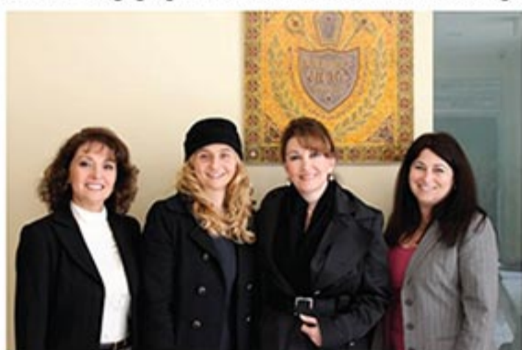
Panelists at the conference

The conference theme of "Connecting to Your Community" brought a full capacity crowd of high achieving GUSD seniors to the campus of the Western Prelacy in La Crescenta. A panel of professionals and community leaders from a variety of industries such as Petroleum Engineering, Education, Politics, and Performing Arts, addressed the participants about leadership qualities and the importance of giving back to one's community. The second half of the conference was highlighted by students engaging in interactive activities, focusing on effective communication, self-assessment and goal setting.