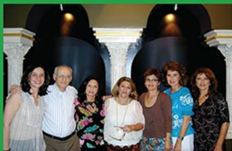
CASPS Board members at event

CASPS extends its gratitude to each and every one of its friends and supporters for valuing its mission, for standing by our youth, and for helping CASPS make a difference.