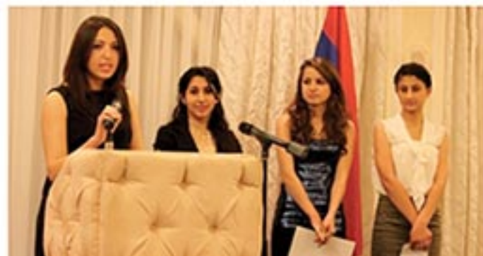
GUSD award recipients