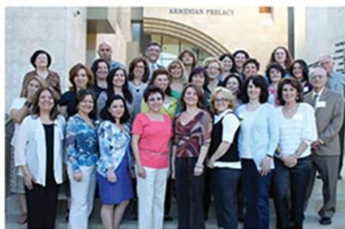
GUSD teacher participants

On April 14, 2011, CASPS hosted GUSD teachers of Armenian descent of all academic levels at the Western Prelacy's Community Room. We shared a light meal, a warm collegial ambiance, and a spirited discussion about new approaches for solving old school issues. The event committee surprised the guests with stylized posters of the Armenian Alphabet and a framed message from CASPS. The gathering created much buzz for continued networking, information sharing about pupil services, and strong support for CASPS' mission.