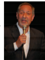
Mark Geragos, Esq.

Four seniors with the highest GPA's, attending Local District 2 high schools, received scholarships generously sponsored by the Armenian Educational Foundation. All other honorees received certificates of achievement. Keynote speaker Mark Geragos spoke eloquently about his family's beginnings in the