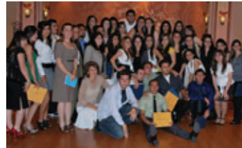
Honorees celebrating their success