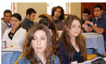
Participants engaged in panel presentations.

On February 16 th , CASPS held a Leadership Conference for GUSD high school seniors at the campus of the Western Prelacy in La Crescenta. The theme of the event was Con-